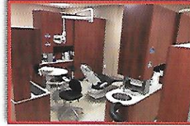
Fairfield City School Based Health Center 211 Donald Drive Located next to Fairfield Middle School