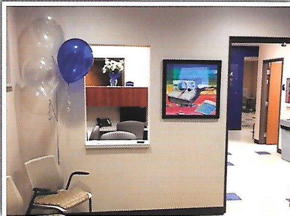
Hamilton City School Based Health Center 250 North Fair Avenue Located in the Garfield School Building